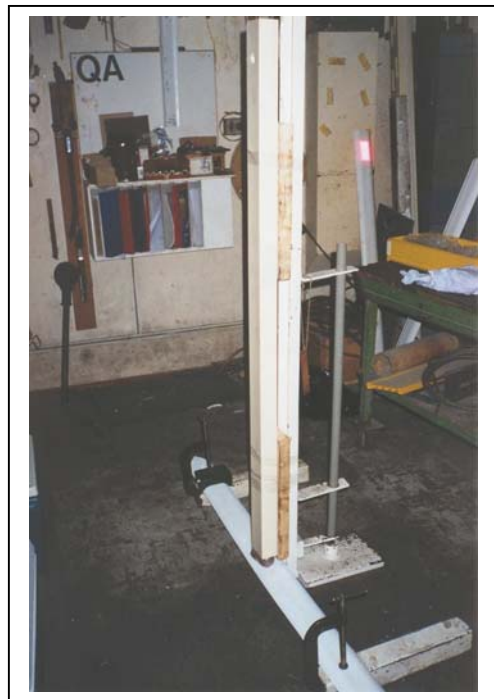
Photograph #5. Impact resistance Testing Unit