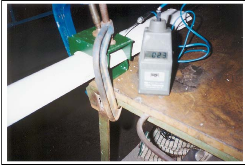
Photograph #3. Guide Post two-part anchor and G Clamps