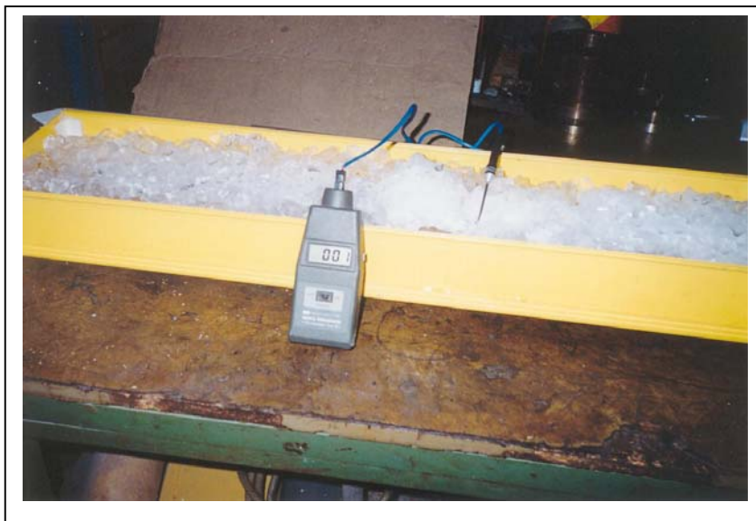
Photograph #2. Digital Thermometer / Ice Bath Unit