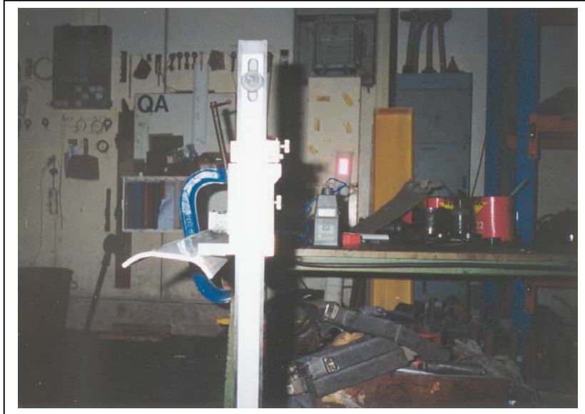
Photograph #1. Vernier Height Gauge at rest on sample post, ambient temp 23°C